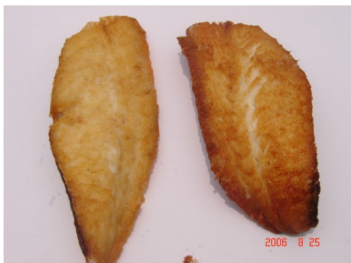
Figure 1: Non-breaded fried fish fillets

From 60 fillets, twelve raw fillets were used as the control. The