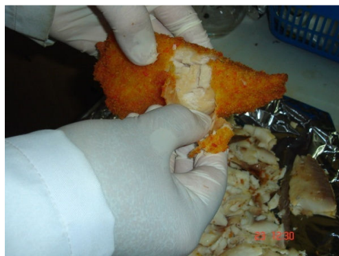
Figure2: Breaded fried fish fillets

remaining 48 fillets were divided into equal groups of 24 fillets. One group was breaded and the other was not breaded. Twelve fillets of each group were deep-fried in sunflower oil and other 12 fillets were deep-fried in palm olein. After frying, fried fillets were allowed to drain in a strainer and cooled in room temperature for 10 min. After draining and cooling the non-breaded fried fillets were analyzed directly (Fig. 1) and for the breaded fried fillets; the breading materials were carefully removed from fish fillets (Fig. 2) and the fish fillets were then analyzed.