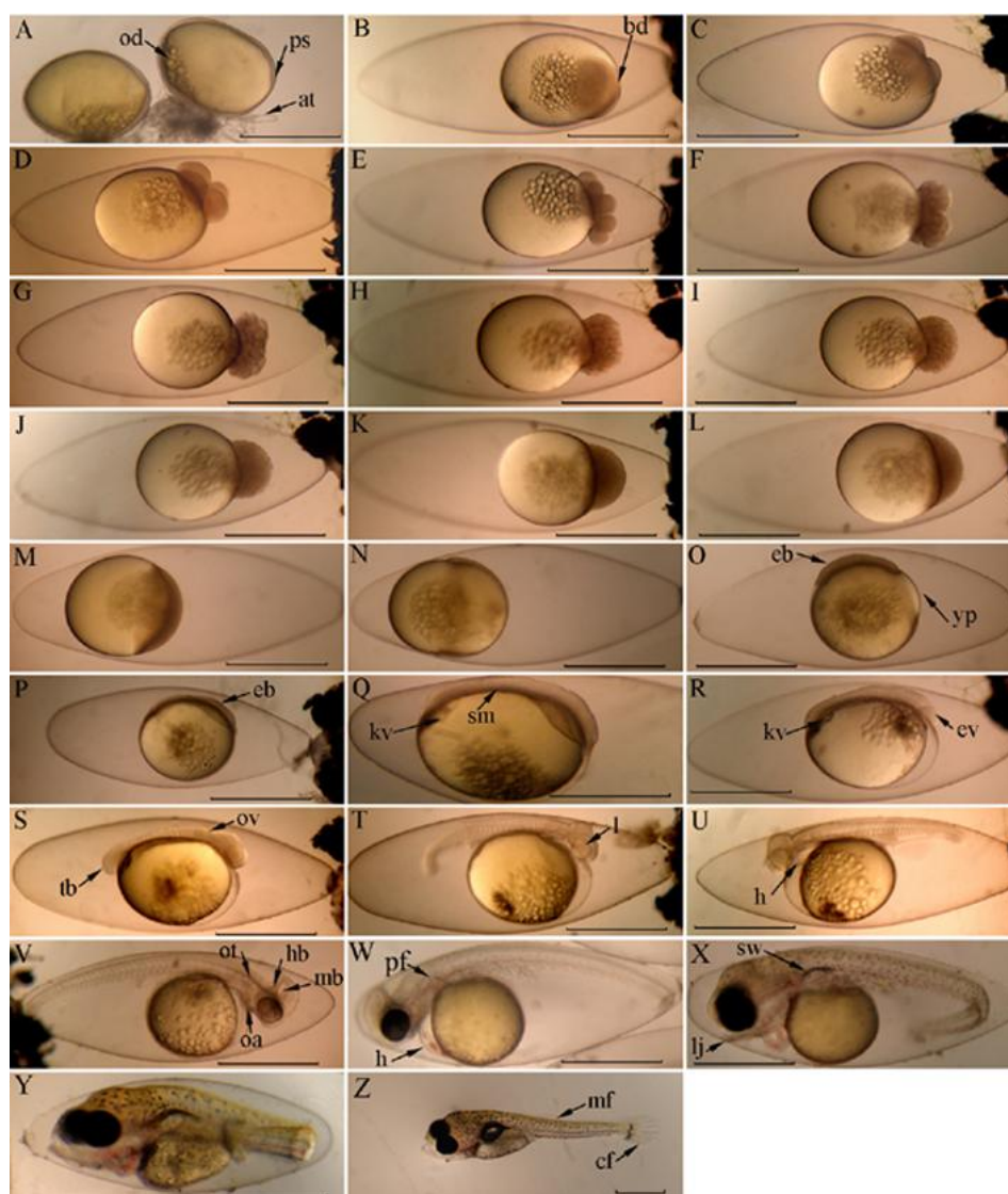
Figure2: Embryonic development of P. glenii at a temperature of 17-21 °C

attaching filament (at), blastodisc (bd), caudal fin (cf), embryonic body (eb), eye vesicle(ev), heart(h), hind-brain (hb), Kuffer's vesicle(kv), lens(l), lower jaw(lj), mid-brain (mb), membranous fin(mf), operculum anlage(oa), oil droplet(od), otoish (ot), otic vesicle(ov), pectoral fin(pf), perivitelline space(ps), swim bladder(sb), tail bud (tb), yolk-plug (yp). Scale bars indicate 1 mm.