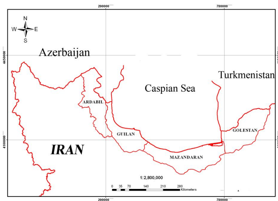
Figure 1: Sampling location in Caspian Sea

muscle samples (filleted and skinned) and liver tissue were dissected, washed in deionized water, weighed, packed in polyethylene bags and stored at -20\text{ }^{\circ}\text{C} for further analyses.