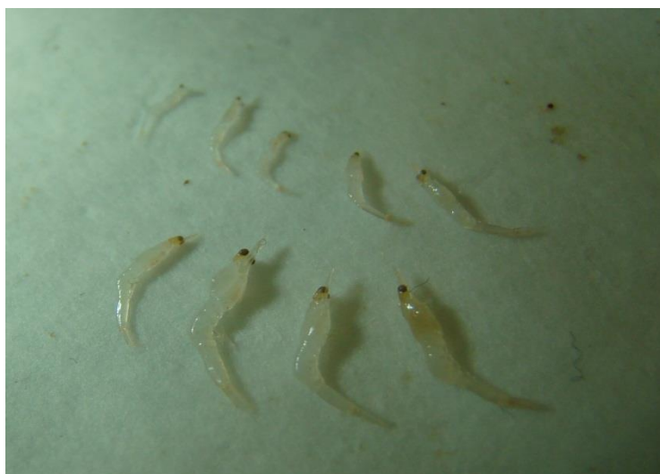
Figure 1: The difference in larval growth rates in treatment C (shrimps in the top row) and treatments A and B (those in bottom row) at the end of experiment period.