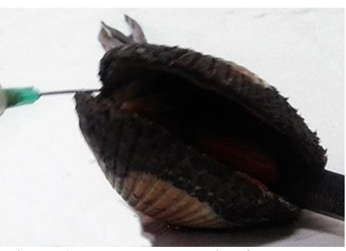
Figure 1: Blood cell sampling from Anadara antiquate.

The blood samples were taken from the posterior and anterior adductor muscle, using a sterile syringe with a 25-guage needle according to the procedure of Lowe and Pipe (1994) (Fig. 1).